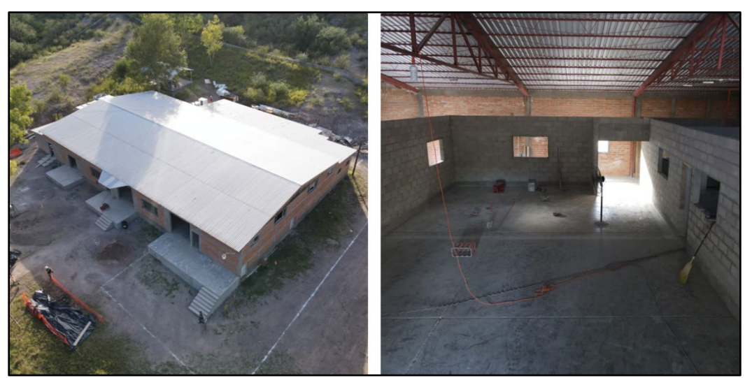
Figure 9: Assay Lab