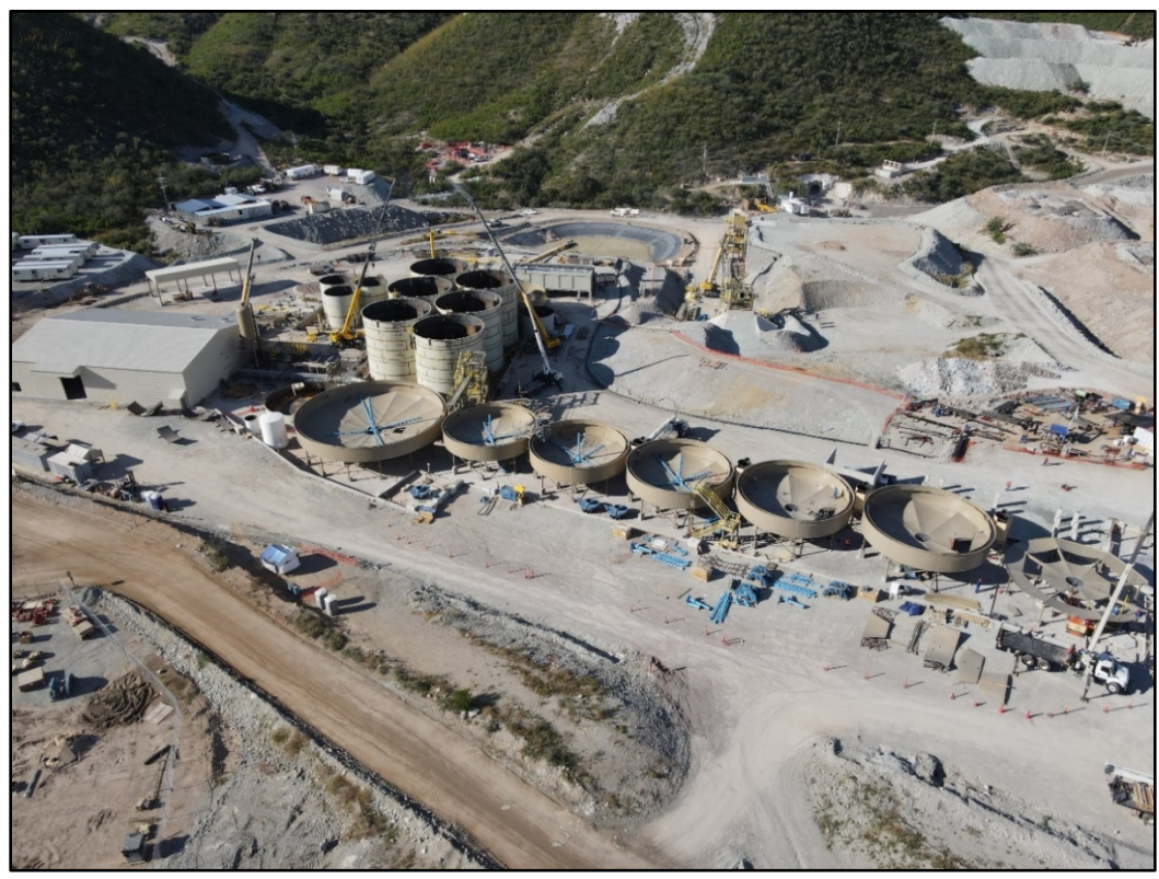
Figure 2: Overview of Process Plant Area