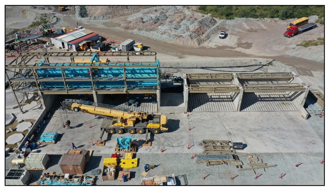
Figure 3: Filter Construction