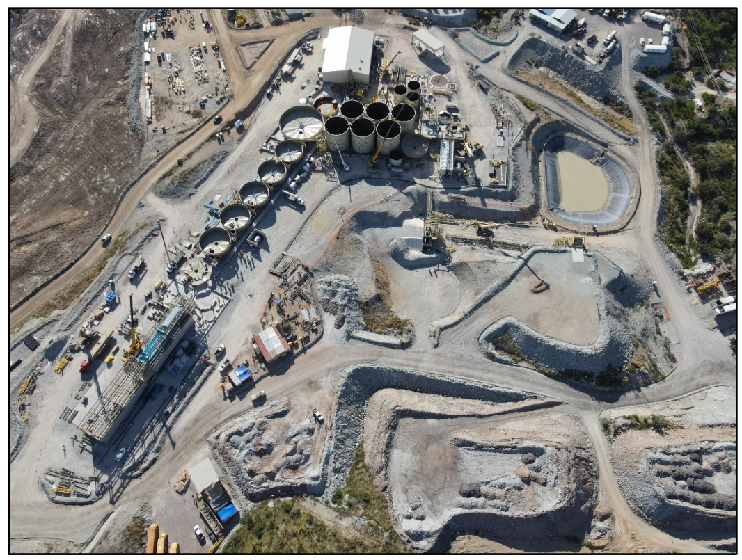
Figure 1: Drone Image of Process Plant Construction and Stockpiles