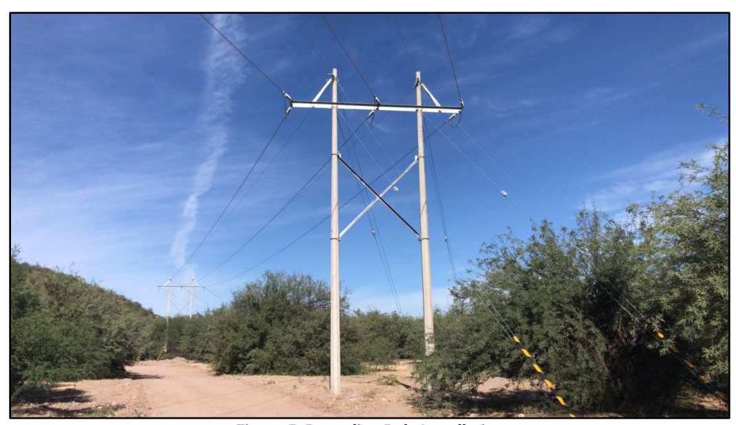
Figure 5: Powerline Pole Installation