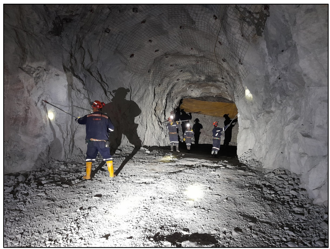
Figure 8: Underground Development