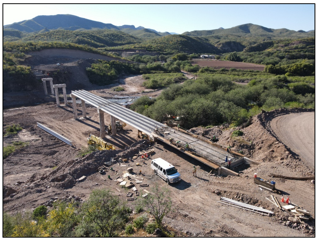
Figure 6: Bridge Construction