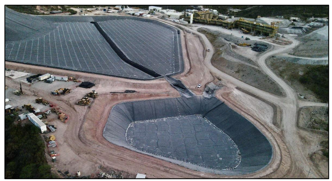
Figure 7: Lined Dry Stack Tailings Facility (Process Plant in background)