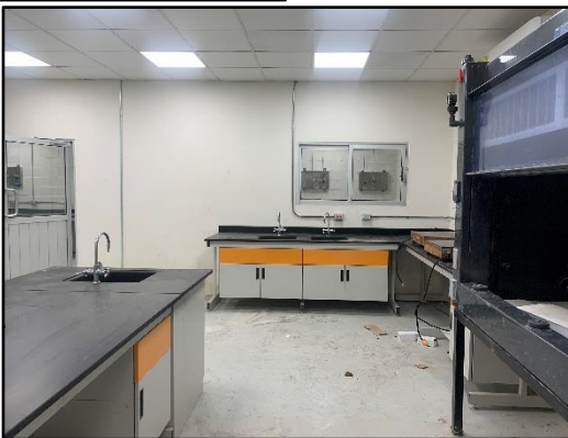
Figure 5: Assay Lab