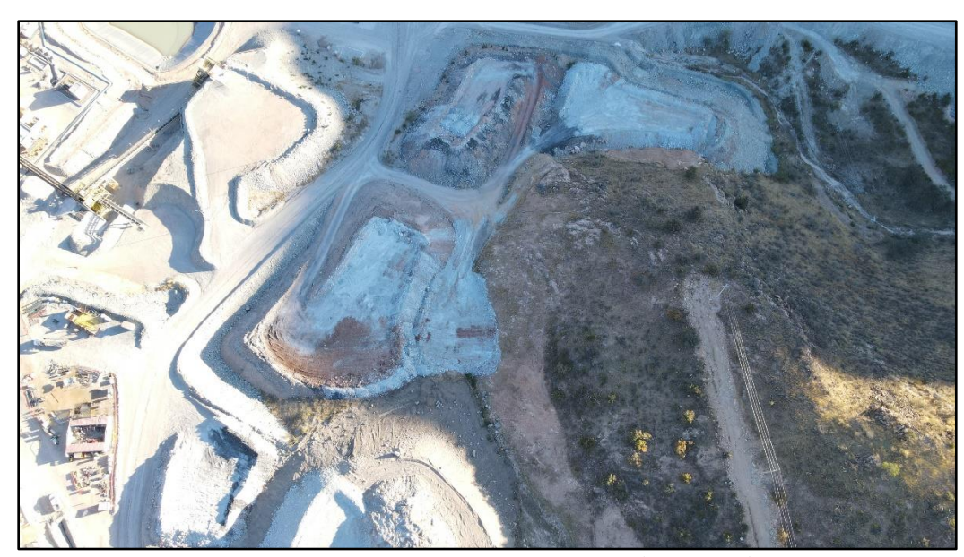
Figure 6: Ore Stockpiles with Crusher (upper left)