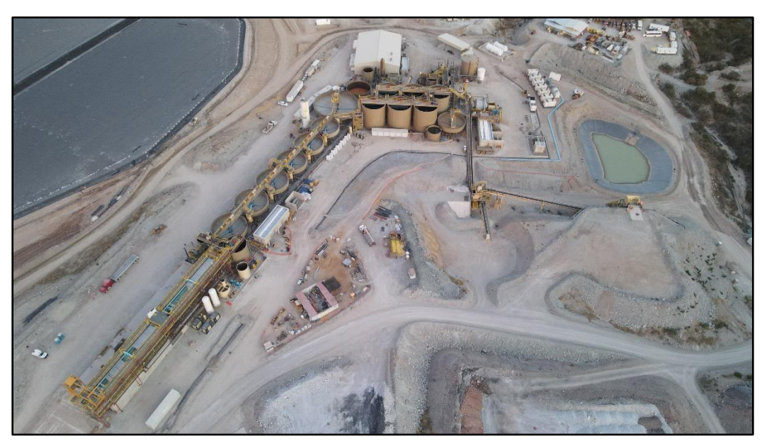
Figure 1: Drone Image of Process Plant