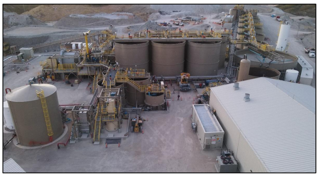
Figure 3: Process Plant