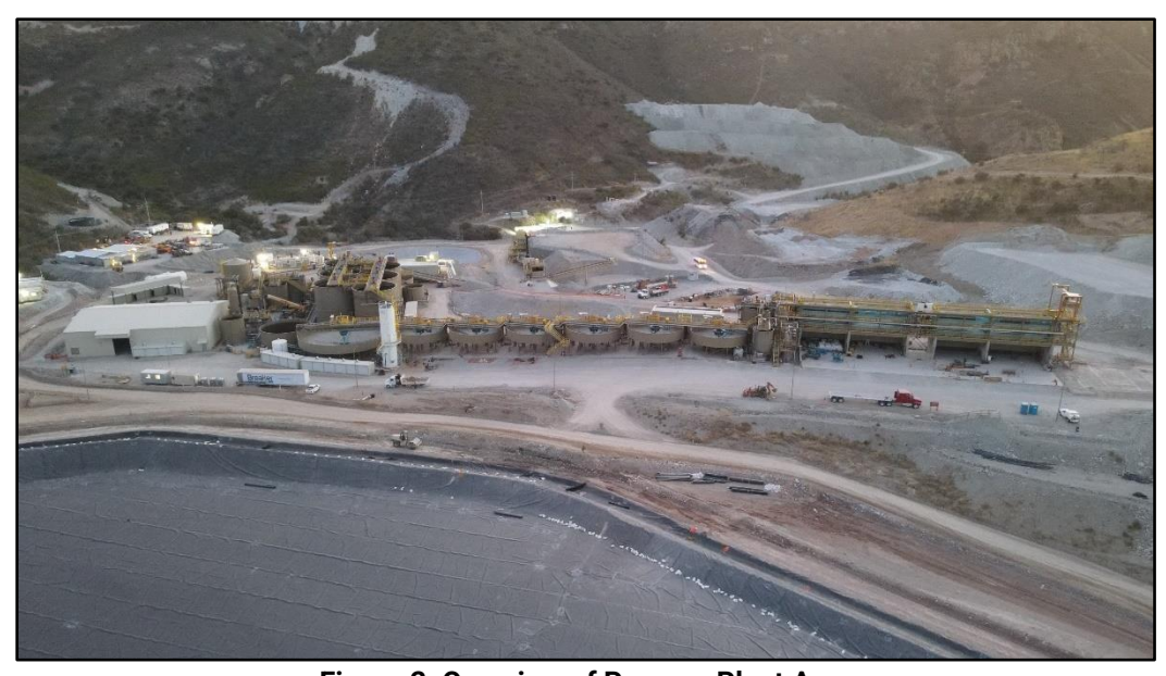
Figure 2: Overview of Process Plant Area