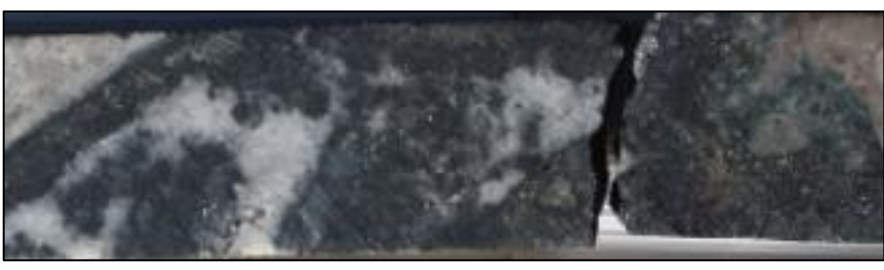
BV20-201: 2.4m @ 555.36 gpt Au and 19,452.8 gpt Ag, or 61,105 gpt AgEq*