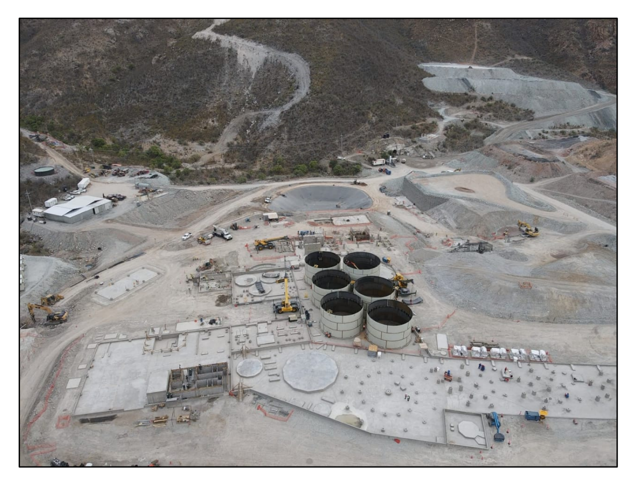
Figure 3: Overview of Process Plant Area