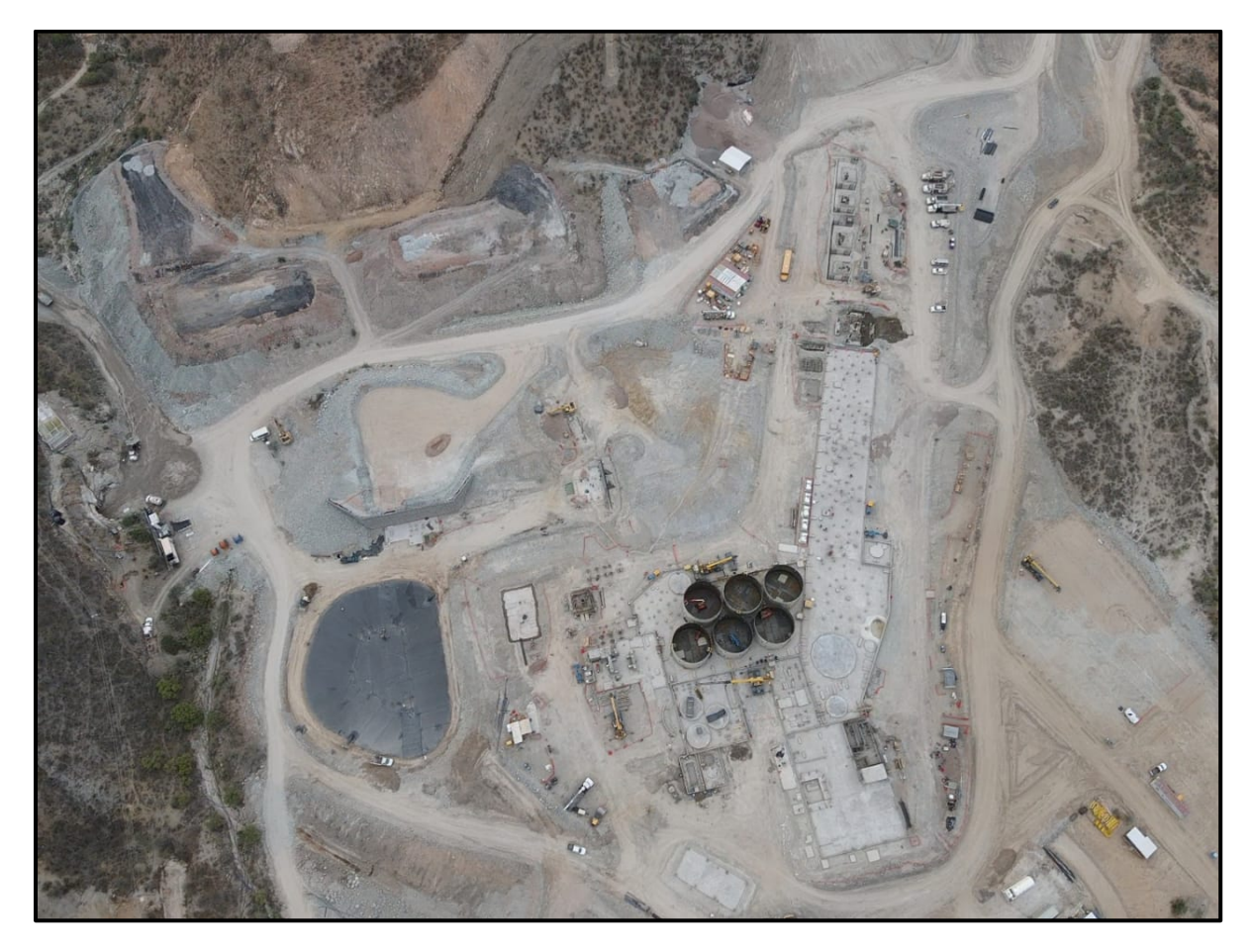
Figure 2: Drone Image of Process Plant Construction and Stockpiles