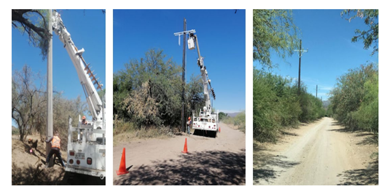
Figure 5: Powerline Pole Installation