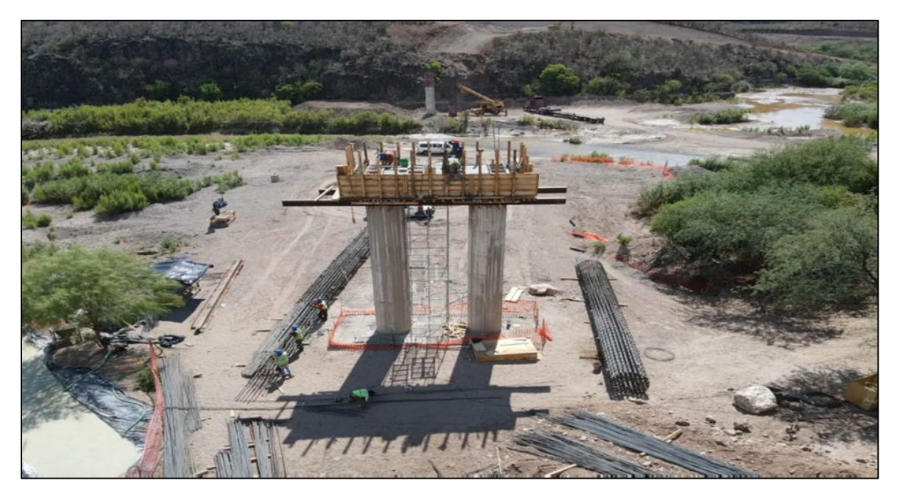
Figure 6: Bridge Construction