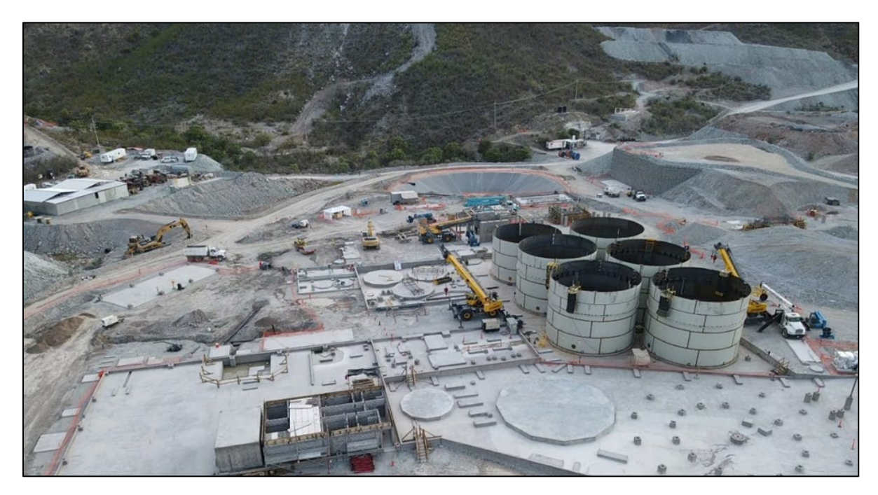
Figure 4: Leach Tank Construction