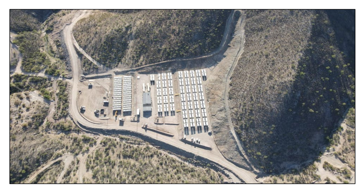
Figure 8: Las Chispas (Single Occupancy Room) Construction Camp