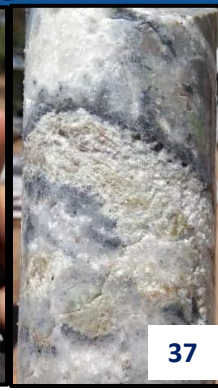
1.5m @ 1,004 gpt AgEq