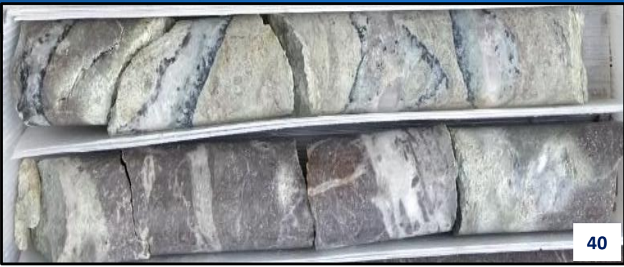
1.6m @ 8.96 gpt Au, 1,078.7 gpt Ag, or 1,750 gpt AgEq including 0.5m @ 26.6 gpt Au, 3,210 gpt Ag, or 5,205 gpt AgEq