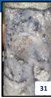
1.8m @ 2,851 gpt AgEq