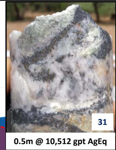
0.5m @ 10,512 gpt AgEq