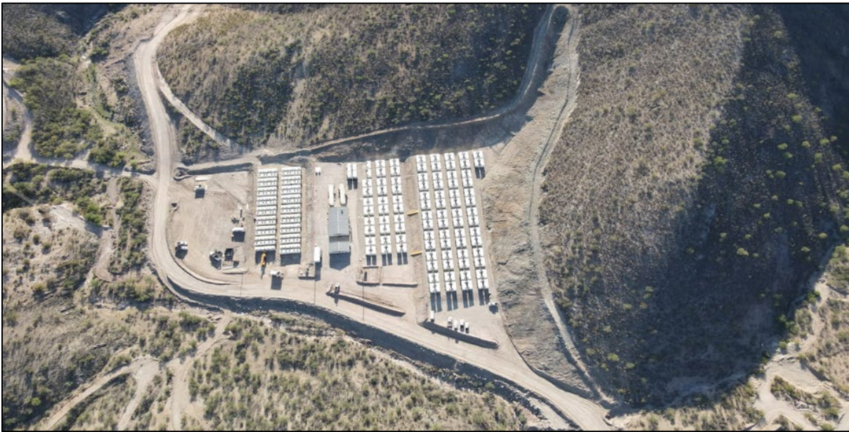
Figure 8: Las Chispas (Single Occupancy Room) Construction Camp