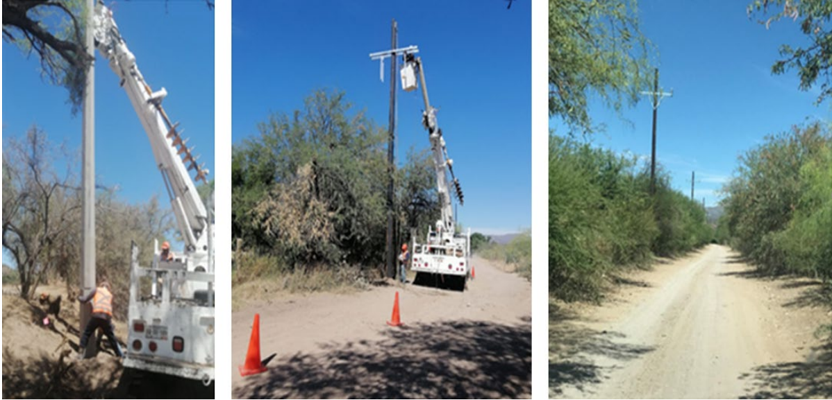
Figure 5: Powerline Pole Installation