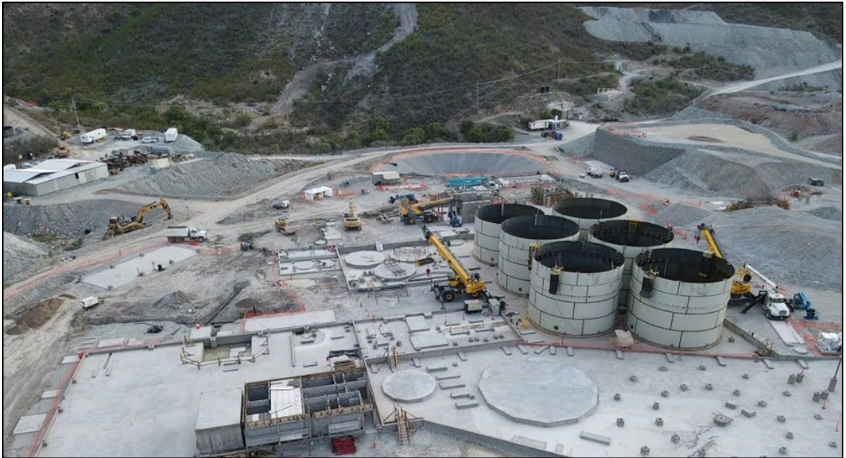
Figure 4: Leach Tank Construction