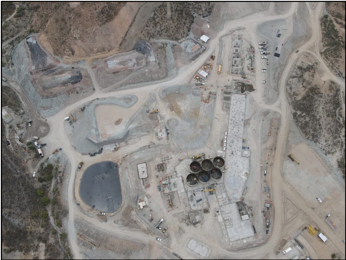
Figure 2: Drone Image of Process Plant Construction and Stockpiles