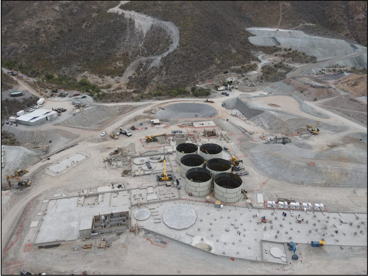
Figure 3: Overview of Process Plant Area