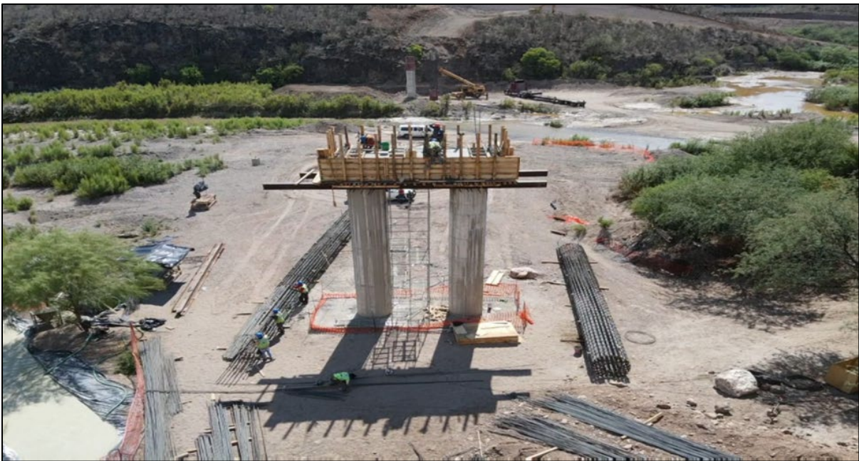
Figure 6: Bridge Construction