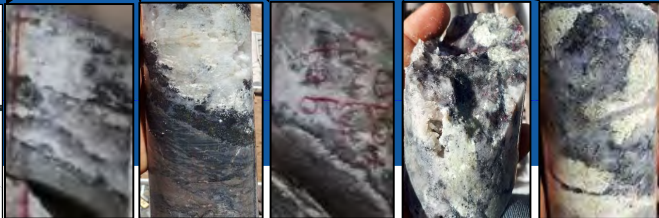
Core with High-Grade Banded and Crystalline Argentite and Pyrargyrite (Silver Sulphides)