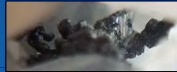
BAN18-06; Close Up of Silver Sulphide Crystals