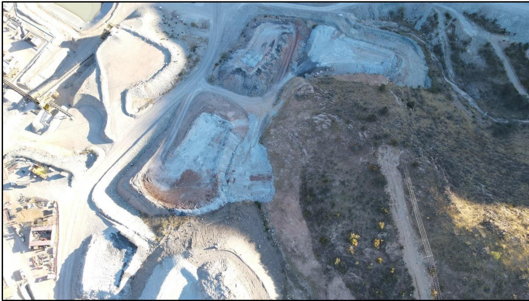
Figure 6: Ore Stockpiles with Crusher (upper left)