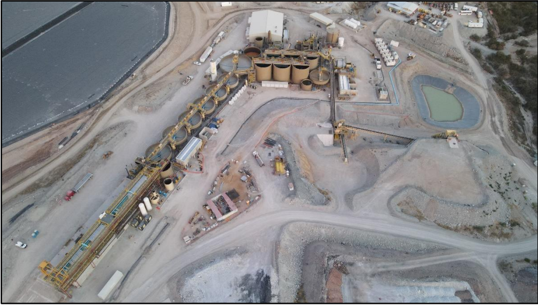
Figure 1: Drone Image of Process Plant