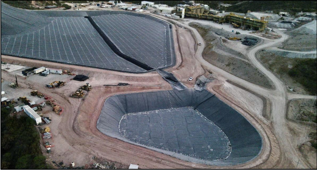
Figure 7: Lined Dry Stack Tailings Facility (Process Plant in background)