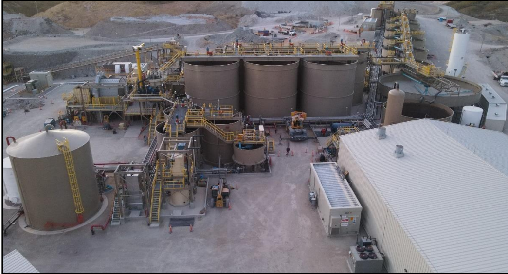
Figure 3: Process Plant