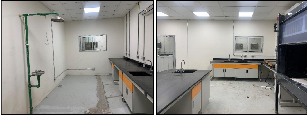
Figure 5: Assay Lab