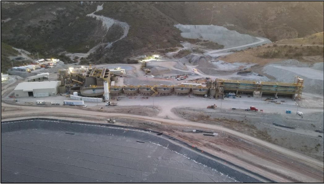
Figure 2: Overview of Process Plant Area